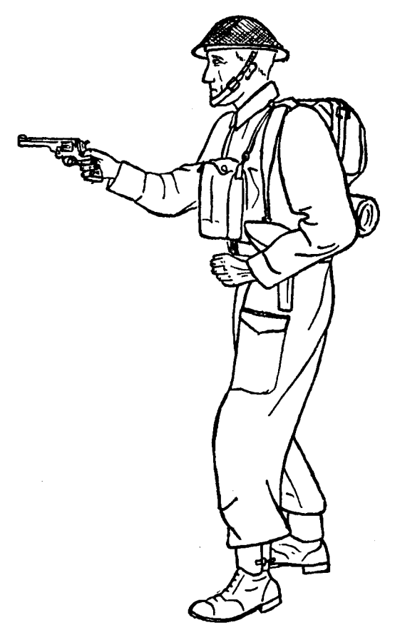
Fig. 7.—Over 10 yards.

the centre of the body, keeping the arm slightly bent. The height to which the pistol is raised will depend on the range to the target. For example, at point blank range (under 10 yds.),