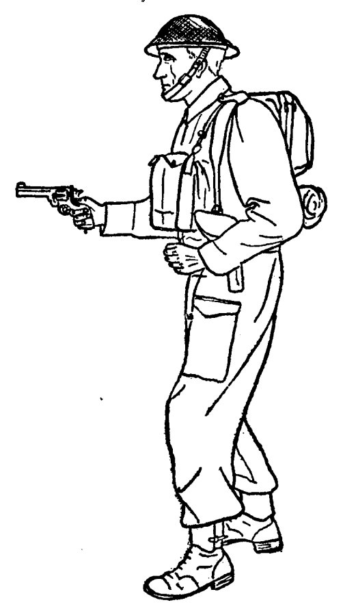
Fig. 6.—Point blank range.

quick succession. The firer must count his rounds as he fires them, to ensure that he will know when to re-load. Never advance with less than two or three rounds in the cylinder.