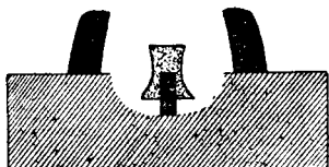
(a) Open sight.